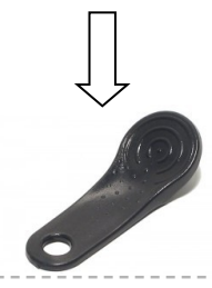
iButton user key.