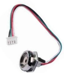
iButton system probe.